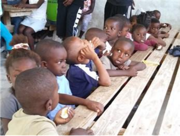
School children enjoy an egg a day

A small team traveled to Haiti in 2012 after Hurricane Sandy had ravaged a portion of the country. Shocked to see so many empty seats in the schools the team learned that much of the agricultural land had been destroyed and that food scarcity had become an issue. Many children were too hungry and weak to come to school. The schools had no funds to provide food for everyone in need. The team immediately arranged for some rice, beans, and pasta to be sent to the area. But a long-range solution was needed.