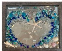
Coastal HEART Resin Picture Frame $45 Please specify Grey or White frame!

To reserve your spot, venmo miranda-spaulding-2. Make sure to mention you are signing up with Peace Dale Church Group