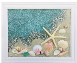
Coastal WAVE Resin Picture Frame $45