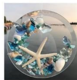
3.5" Glass Coastal Ornament $32 Endless supplies to choose from.