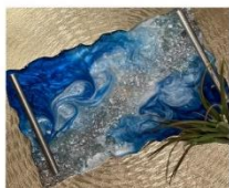
7x11 Resin Decorative Tray $65 Endless color options to pick from. Please specify gold or silver handles at time of purchase