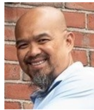
Tha Thia Roca Boston

Addressing Urban Violence and its Root Causes using the principles and values of restorative justice, will be the topic of the next webinar presented by the SNEUCC Restorative Justice Task Team.